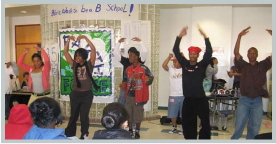
Crowdstopper Fridays: Invited guest must "stop the crowd" and get their attention during lunch breaks.

I believe that we, as a program, made a difference. It was a long and hard road. There were many times I wanted to give up because it felt like I was wasting time. Some of the people, I worked with just didn't care and thought playing football was more important than school work. It made me madder than anything because these people were really smart, but didn't want to put any effort. They thought it was not cool to be smart. It took me a long time to get them to understand that they can only go so far with football, basketball, etc. A lot of them believed that if they just played football, they didn't need school. I had to show them that even if they were the best player, what would happen if they were not.